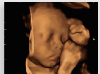
3D of Fetal Face